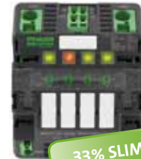
4 channels: 70 mm