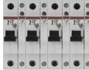
4 channels: 104 mm